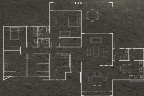
PRAGA B IP/OSB 5 3 194-26 M 2